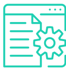
Headless Content Management System