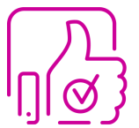
Intuitive User Experience