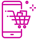
Mobile Personal Shopper App