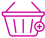
Multi Order Picking